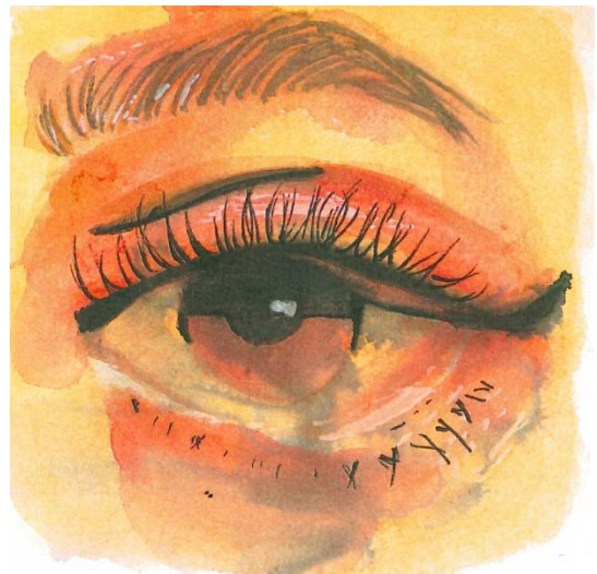
Amazing watercolour work by Rutheesh (5W)