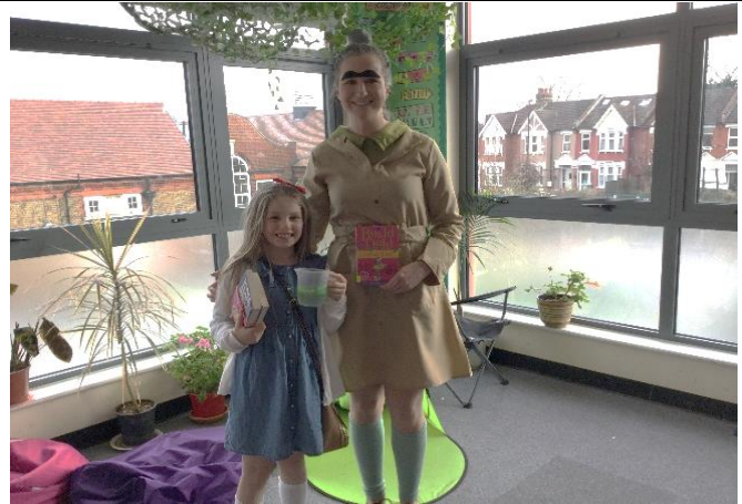
Matilda and Miss Trunchbull