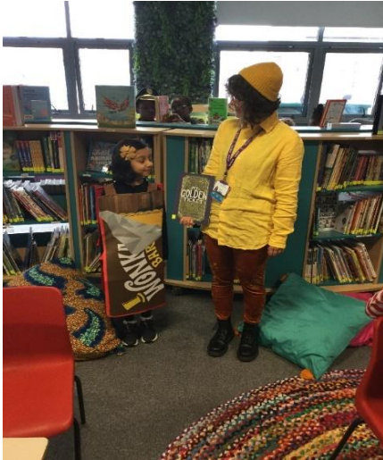
A Willy Wonka Bar and a Golden Ticket