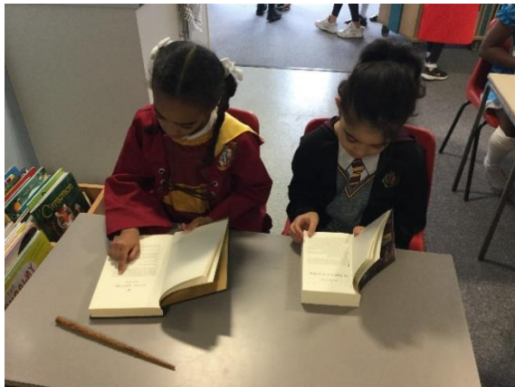
Hermione's reading about Hermione