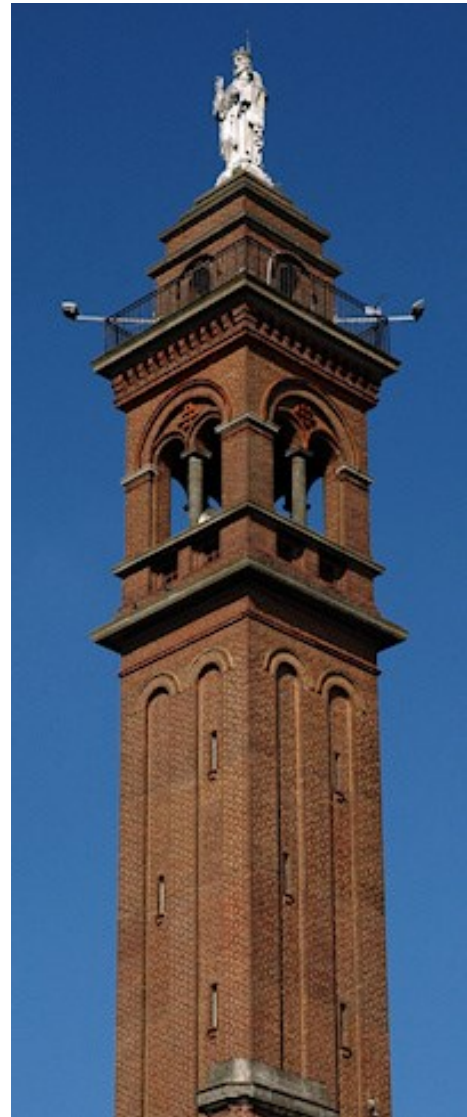
St Saviour's Church Tower

As one of our school leaders or teachers, you'll have children's futures in your hands. Because of that, you deserve all the support we can provide. In fact, all our teachers enjoy the best we can offer, from our renowned Induction Programme for NQTs through to Leadership and Management Programmes that will help you develop your knowledge and skills, no matter what your level of experience.