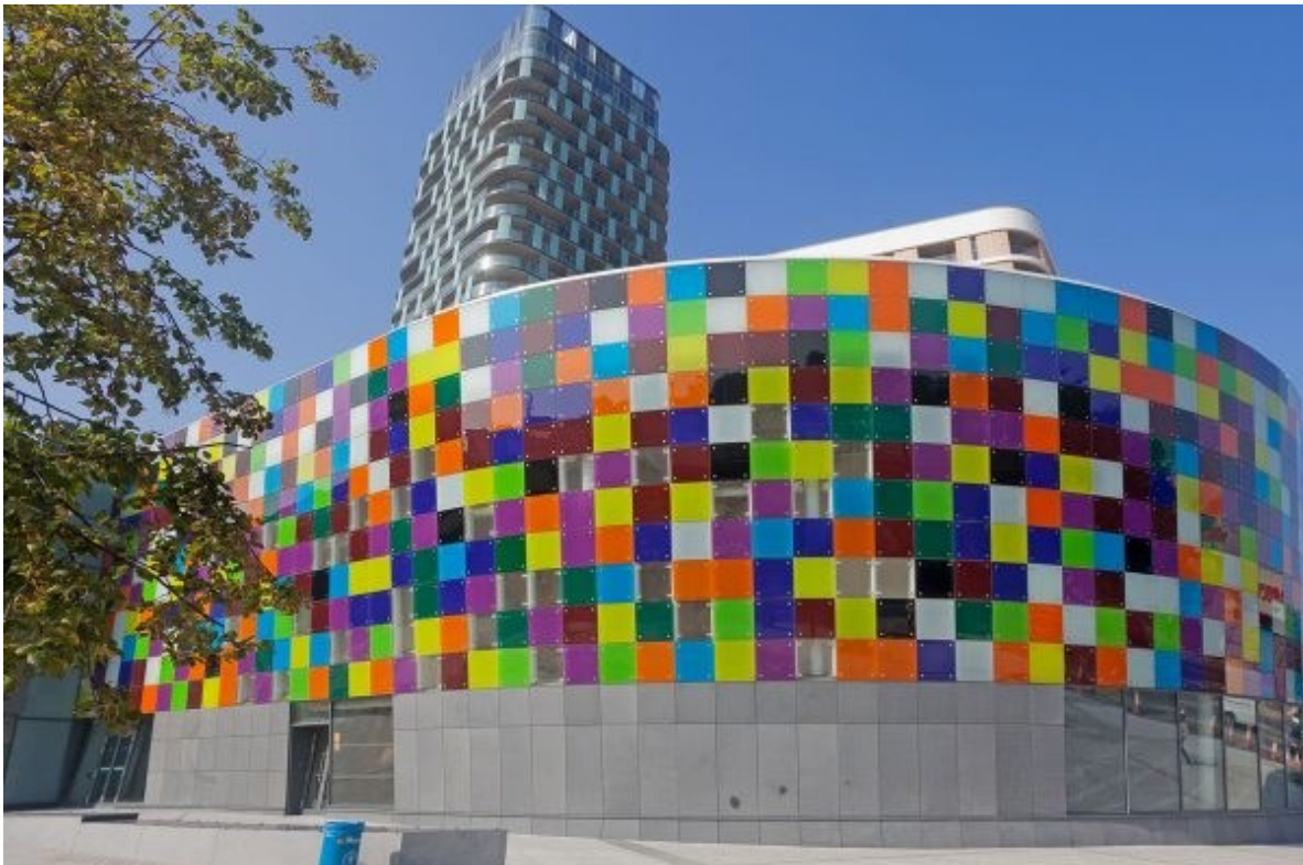
Lewisham Recreation Centre

There's a great deal for you and your family and friends to do. Getting to and from those various places and events won't be a problem either, as we've got great transport links. Most teachers live around a half-hour's walk or bike ride away from work, and enjoy access to good rental properties, shared ownership schemes and interest-free loans for home purchase on the open markets as part of the Keyworker Living scheme. So living and travelling couldn't be much easier.