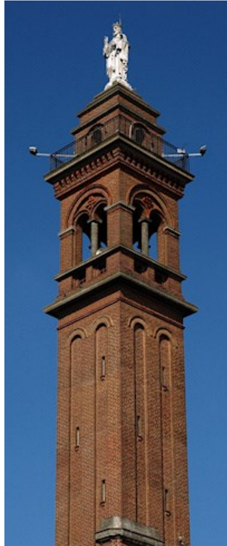
St Saviour's Church Tower

As one of our school leaders or teachers, you'll have children's futures in your hands. Because of that, you deserve all the support we can provide. In fact, all our teachers enjoy the best we can offer, from our renowned Induction Programme for NQTs through to Leadership and Management Programmes that will help you develop your knowledge and skills, no matter what your level of experience.