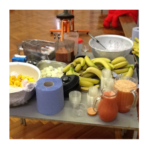
This was a great opportunity to promote wellbeing.